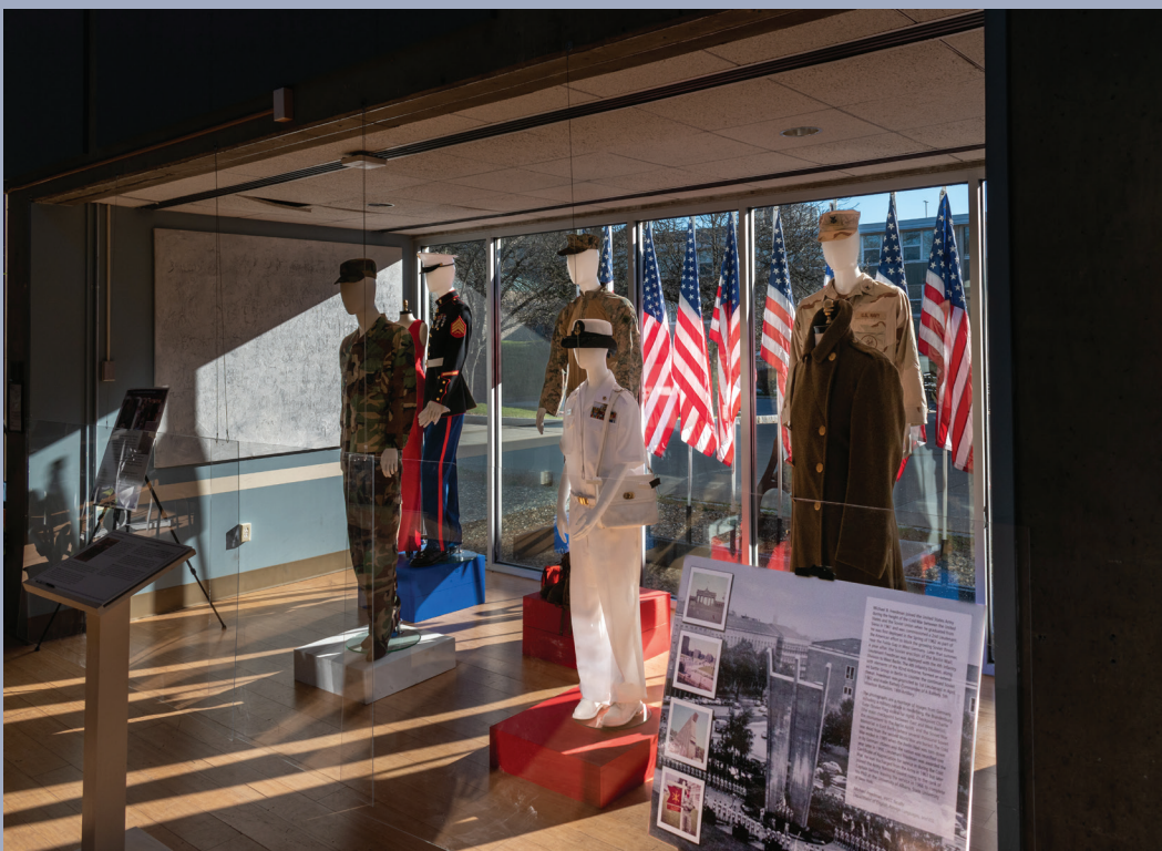
Uniforms of the various services