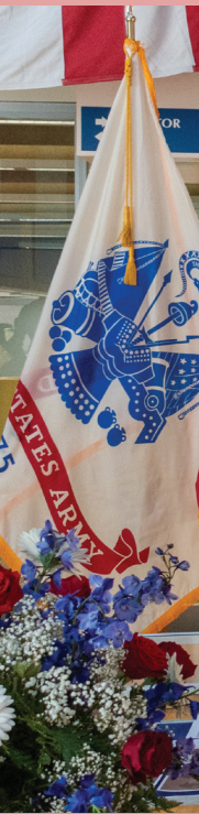
Six armed forces