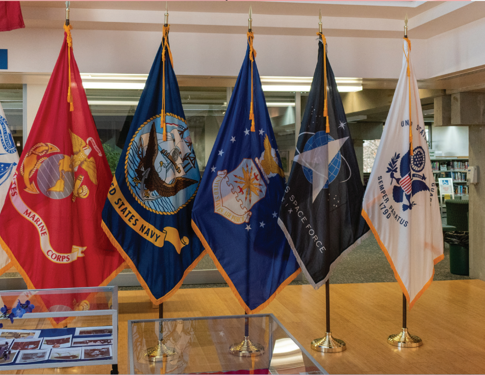
es flags (left to right): Army, Marine Corps, Navy, Air Force, Space Force, Coast Guard