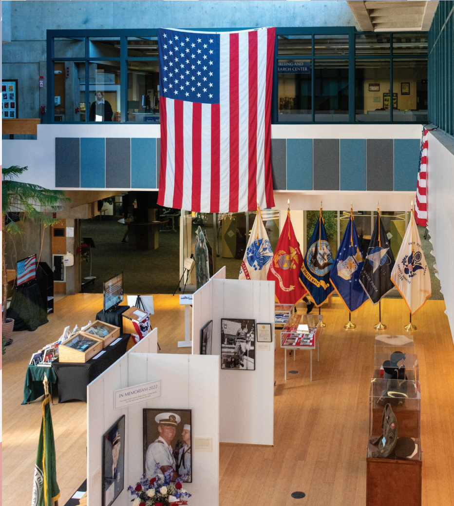
Overview of the 11th annual Afghanistan Pride of Our Nation... Pride of Our College